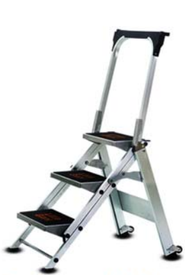
3-step with bar Top step height : 27" Folded height : 44"