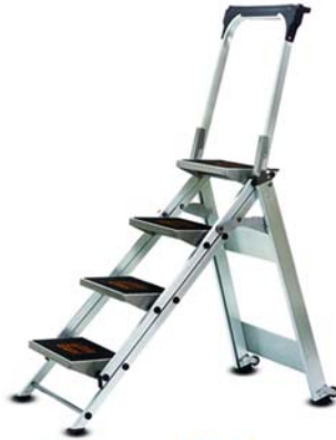
4-step with bar Top step height : 36" Folded height : 56"